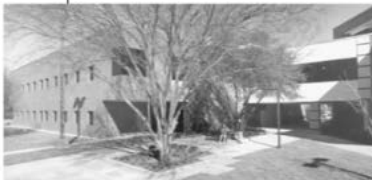
TAMU-T's New Academic Building with state-of-the-art classrooms and faculty offices was dedicated in February, 1999.

Additional information about TAMU-T can be obtained from the university's web site: http://www.tamut.edu . The university's main telephone number is (903) 223-3000 and its FAX number is (903) 832-8890.