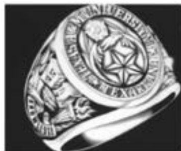
TAMU-T's newly-designed alumni ring.

During the period 1969 to 1973, the Texas Legislature created nine upper-level institutions. Five were designated "free-standing" and four were designated "centers." East Texas State University at Texarkana, established in 1971, fell into the "center" category.